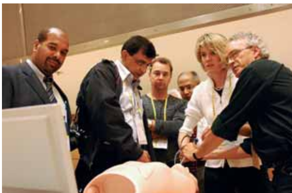
Congress Postgraduate Courses offer hands-on education to participants

Ten School Courses ran in 2007 and early 2008. Topics included cystic fibrosis, lung transplantation and pulmonary rehabilitation. Course locations ranged from Prague in the Czech Republic, to Edinburgh in the UK.