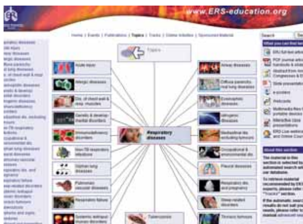
The searchable “tree”: a new system of organisation for e-Learning Resources