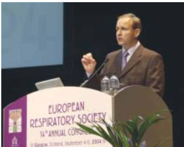
Micheál Martin (Irish Minister for Health and Children), speaks during the opening ceremony of the ERS Annual Congress

The 2004, 14th ERS Annual Congress was held in Glasgow (Scotland, UK) and exceeded all expectations.